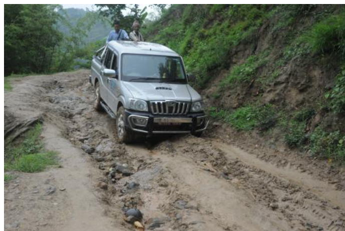
Donated pick-up truck in operation

The costs attributable for purchasing the pick-up truck amounted to EUR 30,080.60.