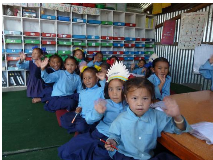
MGML lessons in temporary classrooms built of corrugated sheet metal