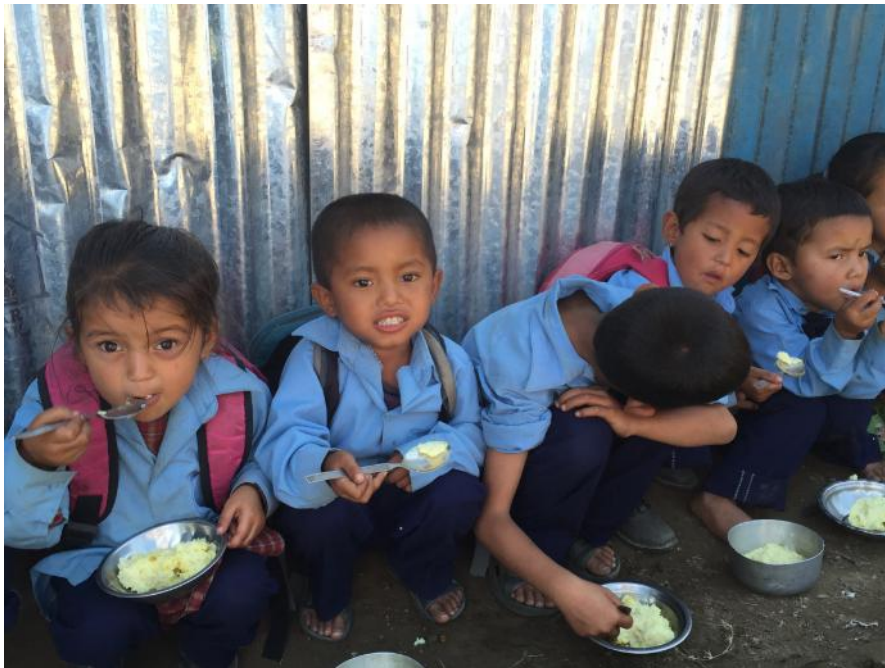
School meals in new school uniforms