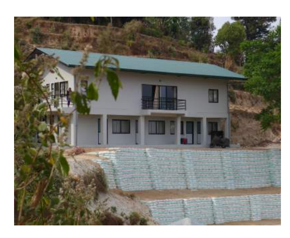
The MMB Centre with its multi-layered wall made out of earthbags