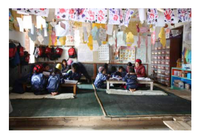
MGML lesson - whether learning in the group, alone, or under the guidance of the teacher, each child is supported here individually

The Millennium Alliance uses the slogan, "Inspiring Innovation, Sharing Solutions". What is the idea, or the basic theory behind this? India has a host of problems in nearly every sphere of human life, that directly concern the population and its wellbeing. Numerous institutions and individuals work meticulously at finding a solution, often unnoticed by politics.