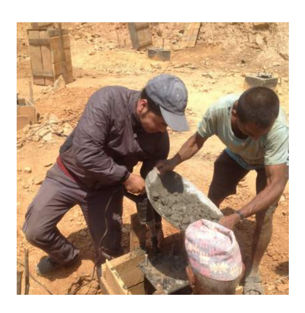
Working on the foundation