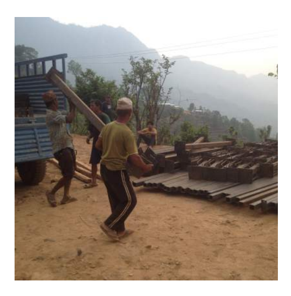
Arrival of the materials

We also express our sincere thanks to all the donators and helpers whom we have not been able to name personally due to their large number.