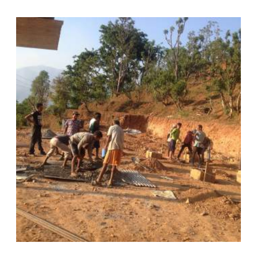
Possible at last - the reconstruction of the Lower Secondary School Gyanodaya, Katunje in the district of Dhading – one of the 10 locations where work could be resumed..