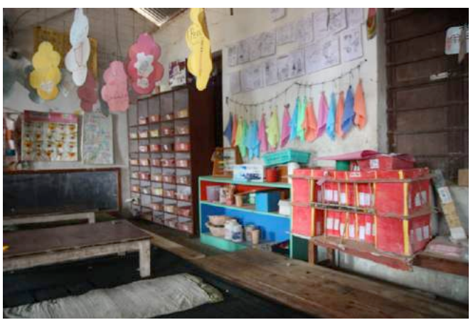
The classroom with child-friendly facilities

And indeed, there are ingenious and surprisingly successful solutions, time and time again at grassroots, that are capable of being applied - also gainfully in other places - both nationally and internationally. Therefore it is essential to found partnerships, promote their innovative capacity and ultimately spread these new methods. For this purpose, prizes are awarded by the MA in the sectors for agriculture, power supply, water resources management, education and health.