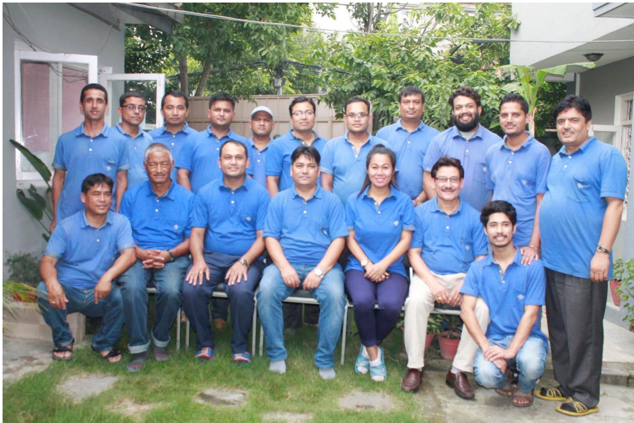
GNHA Team in Nepal