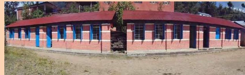
Kutidanda Secondary School, Bhimeswor-12 (Two RCC Buildings repaired)