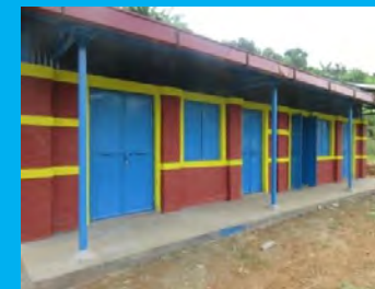
Orbang BS, Benighat Rorang-