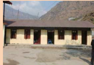
Setidevi Panchakanya BS, Barabise-8 (Truss module repair)