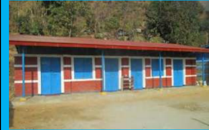
Basukidevi BS, Barabise- (Truss Module II)