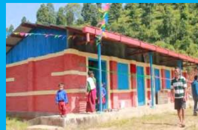
Sunkanya BS, Netrawati Dabjong-5 Truss module