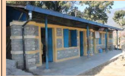
Tripurasundari BS, Bhimeswor-2 (Building II)