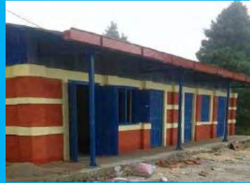
Devasthan BS, Falametar (Two Truss modules)