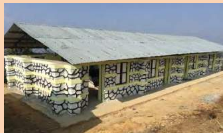
Namobuddha BS, Namobuddha- (Truss module repaired)