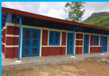
Baljyoti ECED, Netrawati Dabjong-5