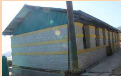
Tikhatal PS, Bhimeswor- 2 (Truss Building repaired)