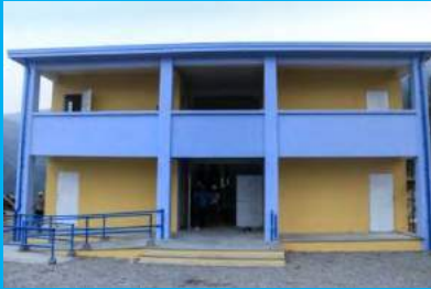
Kalikasharan BS, Melamchi (RCC module new construction)