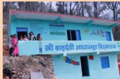
Bahradevi BS, Barabise- (RCC module repaired)