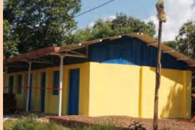
Chandeshwori BS, Nilakantha-11 Truss module II)