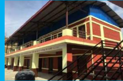
Janakalyan SS, Namobuddha- (Truss on top of RCC module)