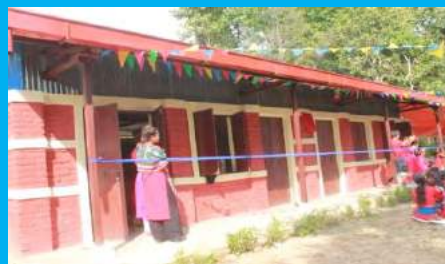
Ghormu ECED, Netrawati Dabjong-5