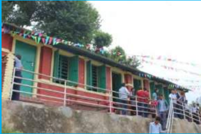
Janakalyan BS, Namobuddha- (Truss module repaired)