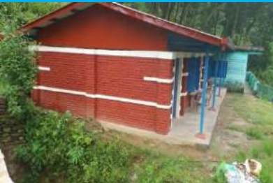
Bahradevi BS, Barabise- (Truss module new construction)