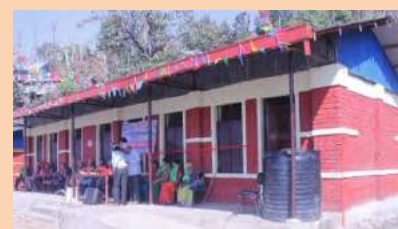
Gyanodaya BS, Netrawati Dabjong-5 ( Truss module II)