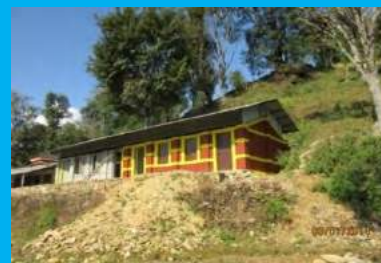
Balbikash BS, Nilakantha-14, (Truss repaired)