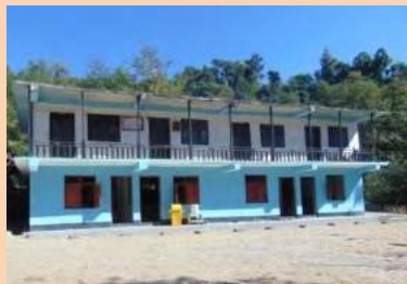
Setidevi BS, Bhimeswor-11 (RCC Building Repaired)