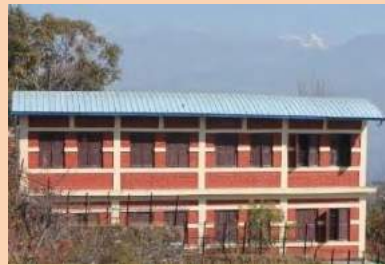
Tikhatal PS, Bhimeswor- 2 (RCC Building repaired)