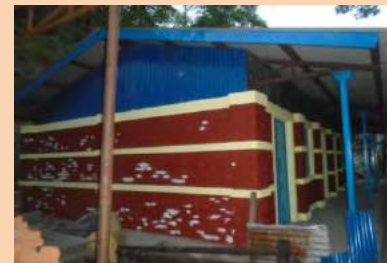
Janajagriti BS, Barabise- (Truss module)