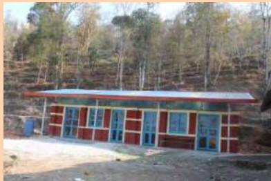
Narayandevi Basic School, Netrawati Dabjong-5