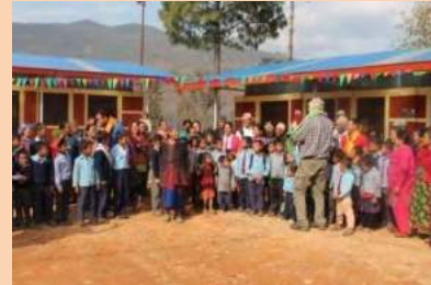
Kundala Secondary School, Netrawati Dabjong-4(Two Truss buildings)