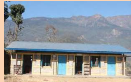
Tripurasundari BS, Bhimeswor-2 (Building I)