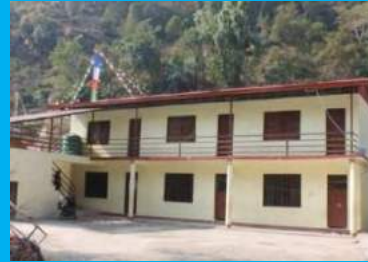
Setidevi Panchakanya BS, Barabise- (RCC module repaired)