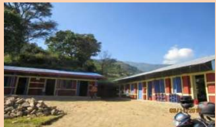
Singeshwori BS, Melamchi (1 Truss module new construction and 1 Truss module repaired)