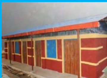
Lilakali Secondary School, Thakre- (Truss module)