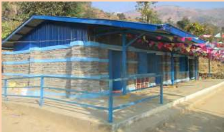
Basukidevi BS, Barabise-7 Truss module I