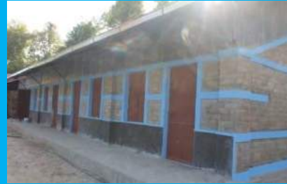
Binayakbal BS, Dhulikhel-6 (Truss modules repaired)