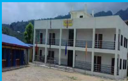
Lilakali Secondary School, Thakre- (RCC module)