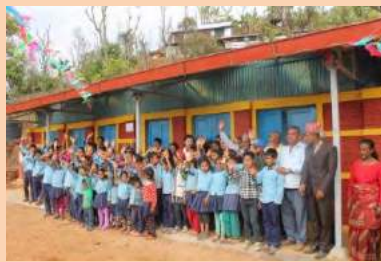
Gyanodaya BS, Netrawati Dabjong-5 ( Truss module I)