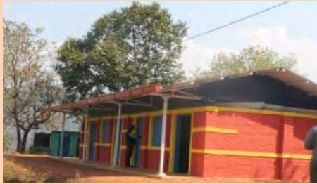
Chandeshwori BS, Nilakantha-11 Truss module I)