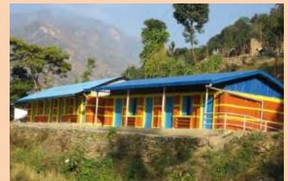
Laligurans BS, ..... (Truss modules I & II )