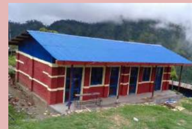
Mahendra Barahi SS, Netrawati Dabjong-5