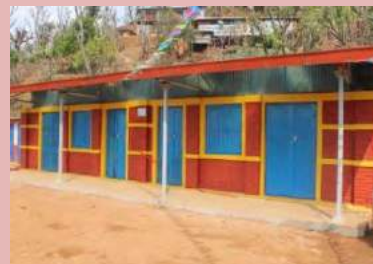
Gyanodaya Basic School, Netrawati Dabjong-5