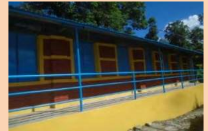
Vishnu Adhyatmik BS, Barabise- (Truss Module repaired)