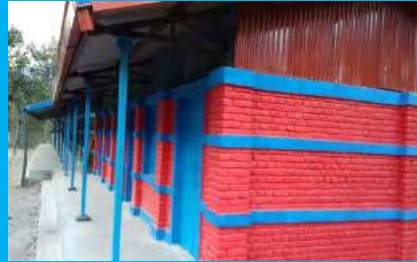
Kalidevi BS, Barabise- ( Truss Module III)