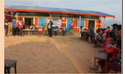
Kanyadevi Basic School, Netrawati Dabjong-4