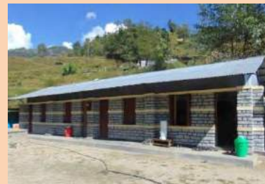
Setidevi BS, Bhimeswor-11 (Truss Building Repaired)