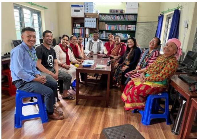
Board of the Suryamukhi Cooperative Society

During this long period, CN has not only supported my formal education, but has also encouraged and sensitised me in various workshops, for example, how to solve conflicts by peaceful means. I also learned how to set goals and develop strategies to achieve them. Moral-ethical issues were also part of the content that was discussed in the various support measures. Recurrent health checks and occasional nutritious food enabled me and my family members to live healthily.