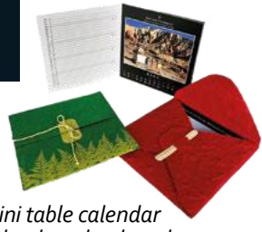
Mini table calendar