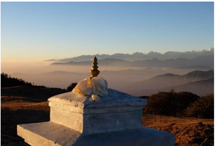
Kuri Village, Dolakha

We are planning a project trip to our GNHA projects from 9th-20th October, 2023. We shall also visit the tourist highlights of Nepal. There is the possibility of extending the trip, individually. If you are interested, please contact the GNHA office. More details can be found on our website.