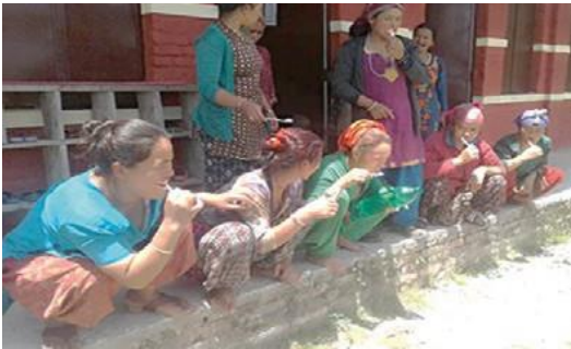
Fun while brushing your teeth

The school then organised a one-day, oral hygiene programme with the support of the GNHA. Toothpaste and toothbrushes were distributed among the mothers and the correct brushing technique was demonstrated. They also practised how to wash their hands properly. The mothers had a lot of fun doing this.